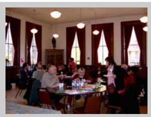
Forum participants enjoy lunch & an informative session on the benefits of borrowing from CAIC—An Alternative Source of Financing.

"When the community takes ownership of a building the community becomes empowered."