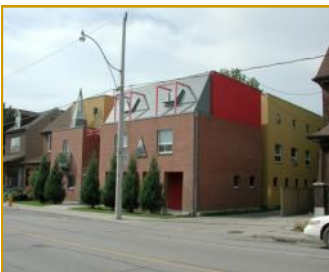
One of Nishnawbe Homes housing projects—Toronto, ON