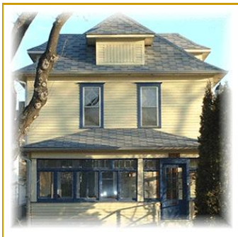
One of the houses owned by Inn Roads Housing Cooperative in Edmonton, AB

Nishnawbe Homes (Toronto, ON) - This organization currently has a first mortgage from CAIC that was instrumental in allowing Nishnawbe Homes to construct 32 units of affordable rental housing for First Nations individuals/families. Occupancy is slated for October however Nishnawbe found themselves in a cash flow crunch due to a number of unforeseen delays in construction & receipt of tax credits. They have asked CAIC for bridge financing for a 6—9 month period. The CAIC board was pleased to provide additional support to Nishnawbe Homes. Funds were advanced in late September.