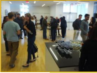
CSI Regent Park—Toronto, ON

Centre for Social Innovation (Toronto, ON) - This is the third financing request that CSI has made to CAIC. The first was to assist with leasehold improvements for their first location on Spadina Avenue. In 2010 CAIC