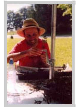
Nurturing a green thumb in the herbal garden community project.