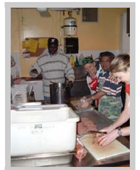
They're cooking up good food in St. John's Kitchen.