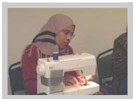
Sewing machines are made available for making clothes & household accessories.