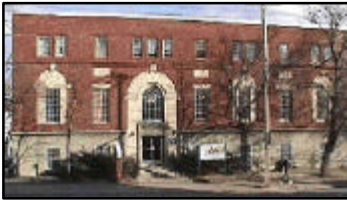
Halifax YWCA, N.S.