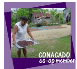
Pictured above is a "fair trade partner" of La Siembra Co-op Inc.

Fair Trade — It seems that "Fair Trade" is in the news these days. More and more consumers are concerned about the ethical treatment of producers (commonly from third world countries). CAIC was introduced to "fair trade" a number of years ago and currently has two "fair trade" organizations in our loan portfolio. (See pages 2 & 4).