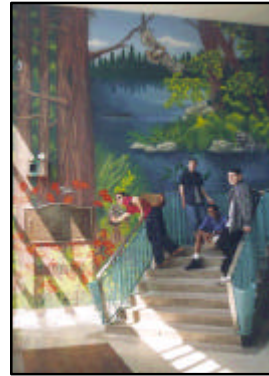
At risk youth