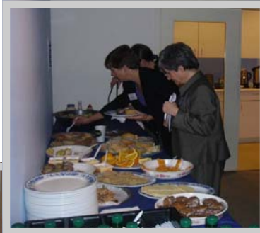
Left photo: CAIC members dig into a tasty luncheon prepared by tenants of 138 Pears Ave. (our hosts for AGM 2006).