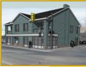
Community Building Cooperative Kingston, ON