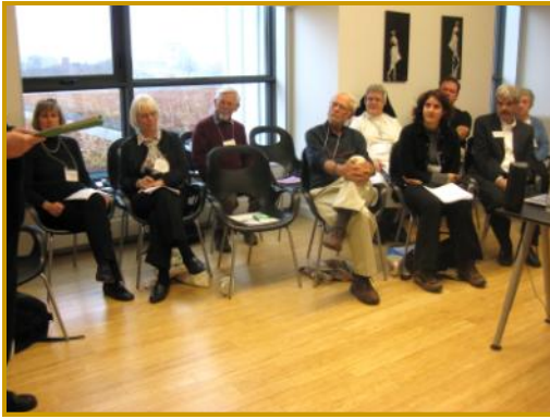
CAIC Members at AGM 2012—CSI Regent Park. (above & below)