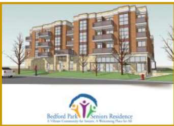
Bedford Park Seniors Residence A Vision Community for Seniors, A Rewarding Place to Live

La Siembra Cooperative (Ottawa, ON) - Many of you have likely seen Camino products on your grocery store shelves. These products are produced by La Siembra Cooperative with ingredients sourced from 23 producer cooperatives across Central & South America and Southeast Asia. This fair trade co-op has been an exemplary borrower and therefore the board was pleased to renew their loan in November.