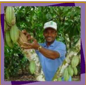
La Siembra Cooperative—coop farmer